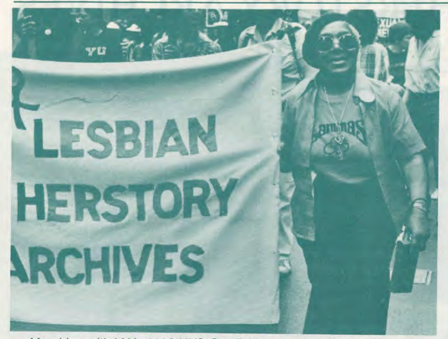
Marching with LHA, 1980 NYC Gay Pride.